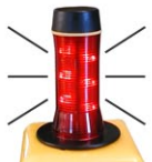
Flashing LED Light