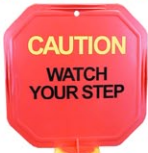
Octagon Warning Sign