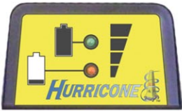
Battery Level Indicator